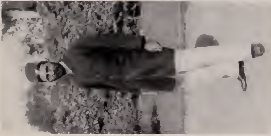
A Parsee schoolmaster